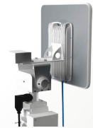
BTS 25QD Quick Deploy Open Air Positioner

IP-66 Enclosure (RJ45 & DC Power Cable Access)